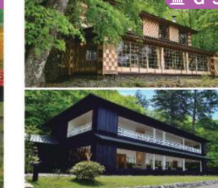
Italian Embassy Villa Memorial Park 8

The beautiful crimson Shinkyo Bridge is part of Nikko Futarasan Shrine, which enshrines Mt. Nantai, and the gateway to the World Heritage shrines and temples of Nikko. It is considered one of the three great bridges of Japan. Inquires: 0288-54-0535 (Nikko Futarasan Shrine)